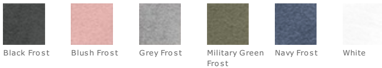
Black Frost Blush Frost Grey Frost Military Green Frost Navy Frost White